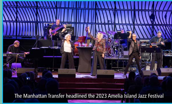
The Manhattan Transfer headlined the 2023 Amelia Island Jazz Festival