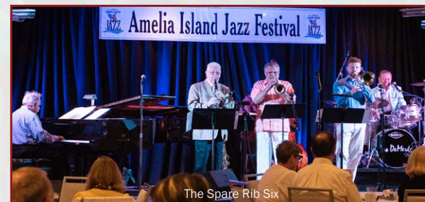
The Spare Rib Six