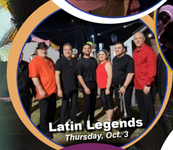
Latin Legends Thursday, Oct. 3