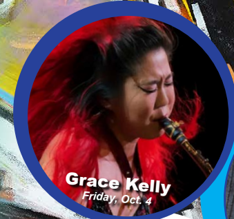
Grace Kelly Friday, Oct. 4