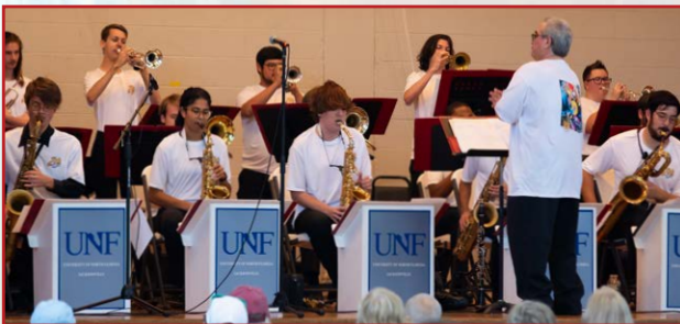
University of North Florida Jazz Ensemble 2 at the Jazz at the Atlantic Rec Center